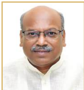
Sanjay Shamrao Dhotre Minister of State for Human Resource Development

India aspires to become a 5 trillion dollar economy in a near future. To reach this mark, it needs to evolve system and mechanisms to convert the present demographic dividend into high quality technical human resource, capable of doing cutting edge research and innovation, and deep-tech entrepreneurship. At this juncture, the MHRD's Innovation Cell and AICTE have brought out the 'National Innovation and Startup Policy 2019' for students and faculty.