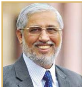
Anil D Sahasrabudhe Chairman, AICTE

I am very happy to see that the detailed guidelines have been issued by Ministry of Human Resource Development on National Innovation and Startup Policy for students and faculties of higher education institutions which further strengthens the Startup Policy released by All India Council of Technical Education in November 2016 from Rashtrapati Bhawan, just after few months of Startup action plan announced by the Government of India in January 2016.