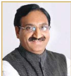
रमेश पोखरियाल 'निशंक' मानव संसाधन विकास मंत्री

स्टार्ट-अप इंडिया भारत सरकार की एक प्रमुख पहल है, जो नवीन आविष्कारों को हाथ में लेने, सहायता और प्रोत्साहनों के वित्त पोषण, उद्योग-शैक्षणिक भागीदारी और इन्क्यूबेटरों के बुनियादी स्तंभों पर आधारित है।